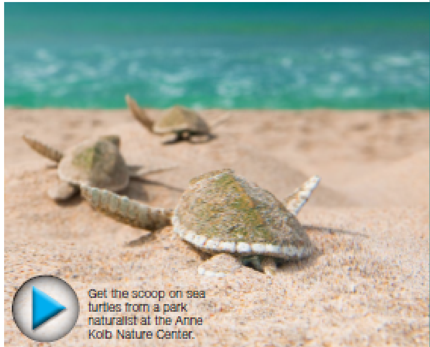
Get the scoop on sea turtles from a park naturalist at the Anne Kolb Nature Center.

Anne Kolb Nature Center See endangered species at this 1,500 mangrove ecosystem. Explore by kayak, boat or boardwalk trails. Climb or ride the elevator to the top of the Observation Tower for views that steal your breath away. West Lake Park, Hollywood.