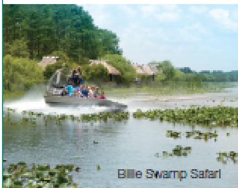
Billie Swamp Safari